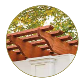
Joists and Purlins 2x8 pine joists with 2x3 pine purlins give ample shade and comfort.