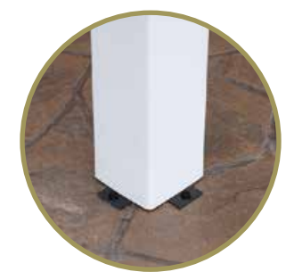
Anchor Brackets Your pergola includes powder-coated anchor brackets and concrete lag bolts.