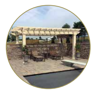
Custom Design Don't see what you like in our brochure? Request a custom design!