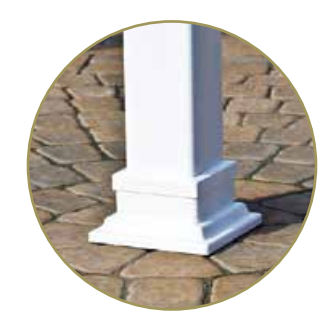
Post Skirts The anchor brackets and bolts are hidden beneath these attractive post skirts.