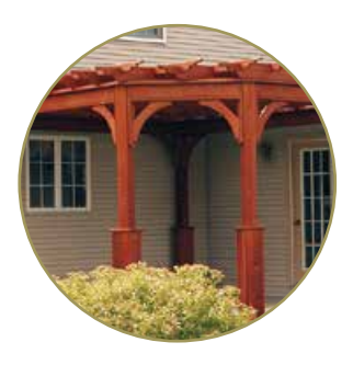
Custom Shapes Do you have a difficult patio or angle? We can help with custom shaped pergolas.