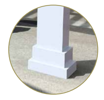
Post Skirt The anchor brackets and bolts are hidden beneath these attractive skirts.