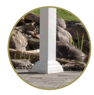
6 x 6 Posts The large 6"x6" posts offer a strong and sturdy base for this unique pergola.