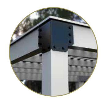
Post & Header Bracket These large brackets make this unit a strong and sturdy structure.