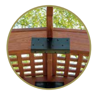
Joist Brackets These powder-coated brackets connect the two-part arched joists together for a strong connection.