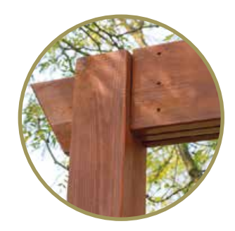
Triple-Ply Headers These heavy-duty headers carry the load of the large arched rafters.