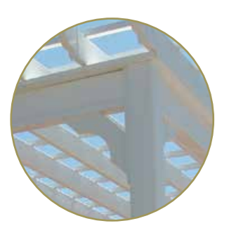
Braces The braces make this pergola a strong and sturdy structure.