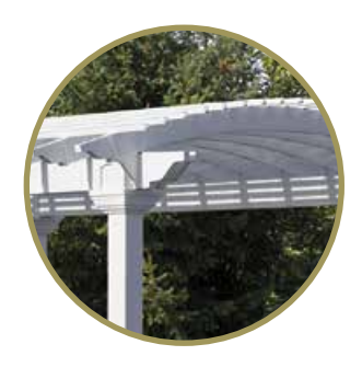
Arched Joists Stand out from the crowd with these continuous arched joists which give your pergola a unique look.