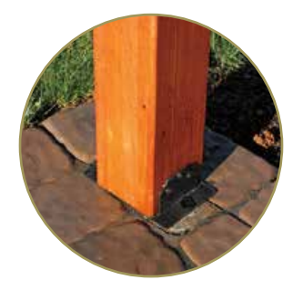
Anchor Brackets These powder-coated anchor brackets attach the pergola to your footers.