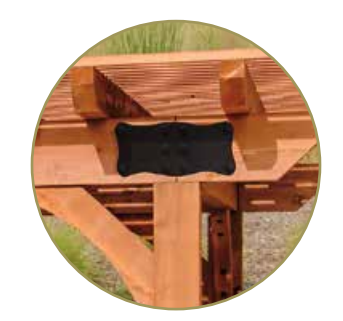
20' Long Units & Longer Includes joining plates.