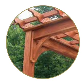
Braces The braces make this pergola a strong and sturdy structure.