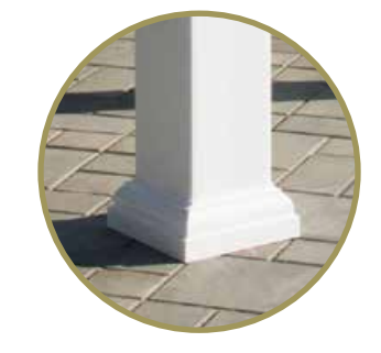
Post Skirts The anchor brackets and bolts are hidden beneath these attractive post skirts.