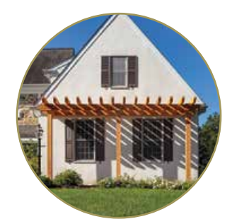
Attached to House We can make most of our pergolas to attach to your home.