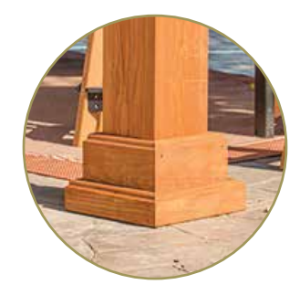
Post Skirts The anchor brackets and bolts are hidden beneath these attractive post skirts.