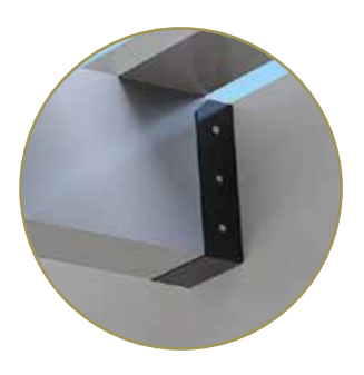
Joist Brackets These brackets attach the joists directly to the headers for a lowprofile appearance.