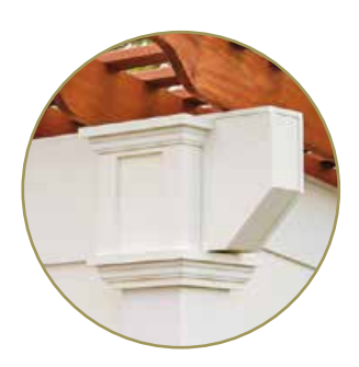
Post Trim The top of each post is covered with this post trim to hide the connecting screws.